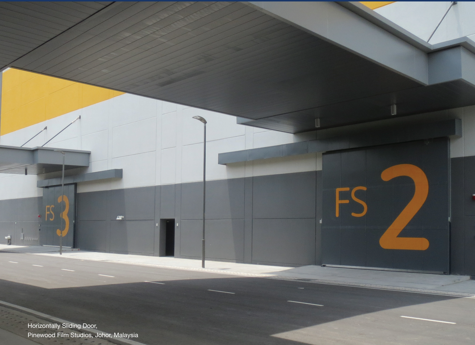
Horizontally Sliding Door, Pinewood Film Studios, Johor, Malaysia