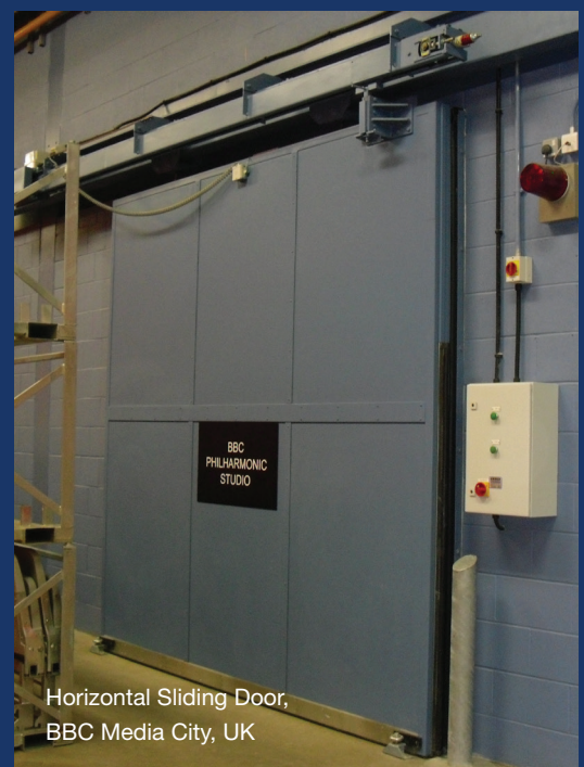
Horizontal Sliding Door, BBC Media City, UK

Large acoustic doors can be fire rated to NFPA 252 eliminating the need for separate fire shutters. The doors feature the Clark Digital Controller (CDC), an encoder positioning system to ensure precise seal compression in the closed position, with automatic reset in the event of power failure. An assured power supply is required but optional battery back-up can be provided if necessary. The Clark Acoustic Fire Door Assembly is an all in one solution that eliminates both the requirement and additional cost of a fire shutter.