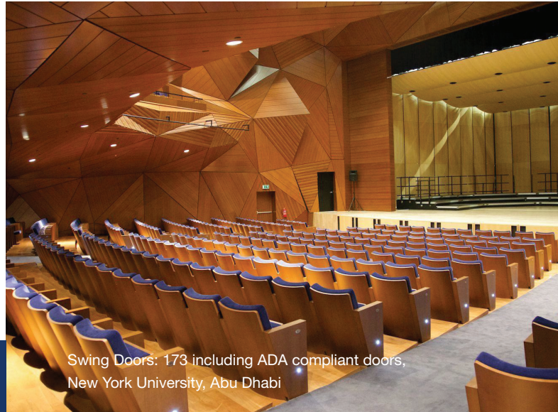
Swing Doors: 173 including ADA compliant doors, New York University, Abu Dhabi

Large size high performance acoustic doors often have a large mass which will impose significant loads onto the building structure. By consulting us early in the design process this loading can often be incorporated into the building without the need for the later addition of expensive secondary supporting steelwork.